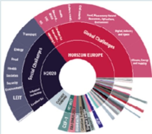
DISTRIBUTION OF THE BUDGET IN THE MAIN EUROPEAN FUNDING PROGRAMMES (2019 - 2022)

Analyse the evolution of European funding in the areas of your interest.